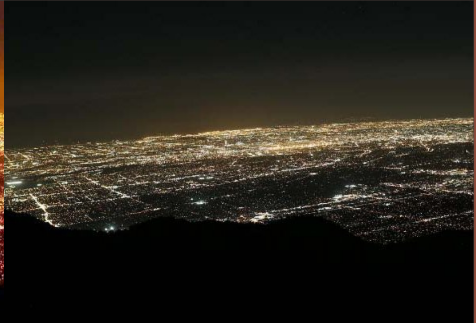
LA from Mt. Wilson 2012