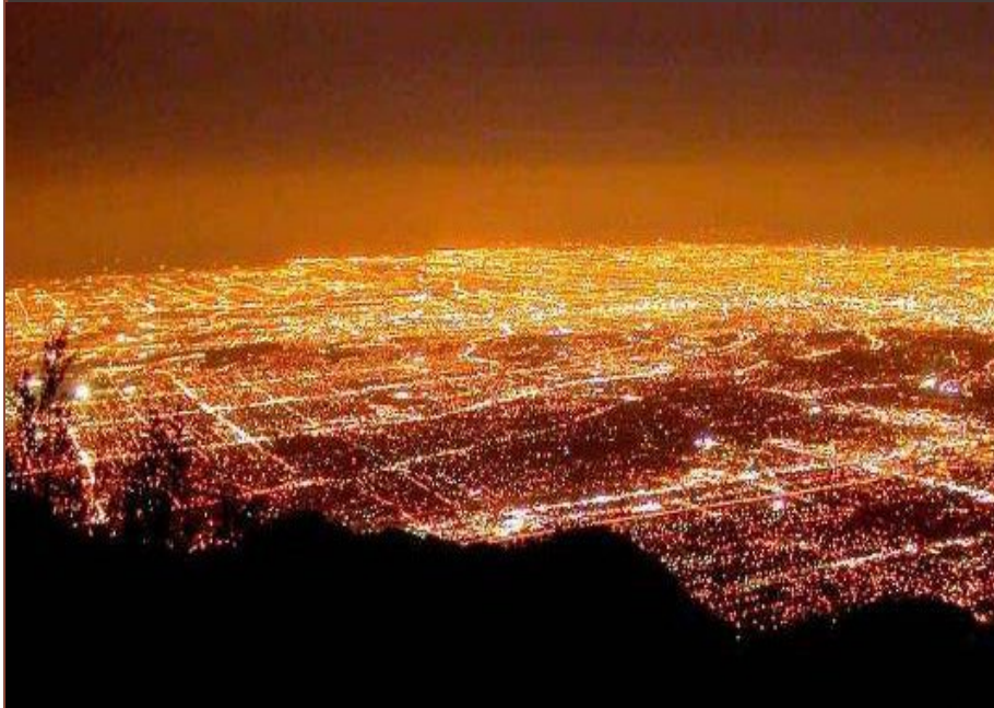
LA from Mt. Wilson 1988